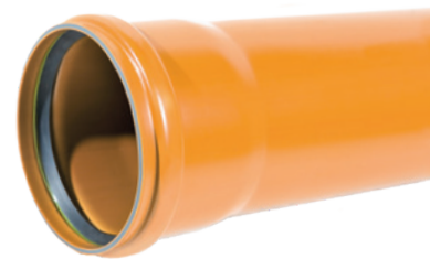
WavSpec SN4 or SN8 PVC Smooth Wall Pipe

Wavin Ireland Ltd | Balbriggan | Co Dublin | K32 K840 Tel. 01 8020200 | www.wavin.ie | info.ie@wavin.com